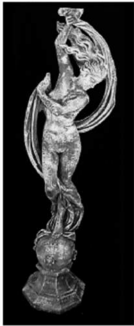
Statua Venere Odalisca