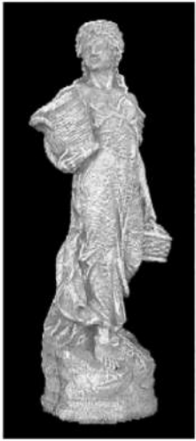
Shopping girl (sml)