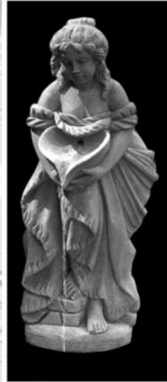
Amoré fountain figure