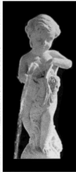
Classic fish boy no 1