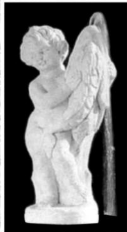
Classic fish boy no 2