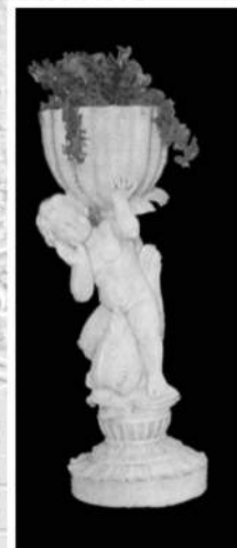
Cupe with basket lrg (L)