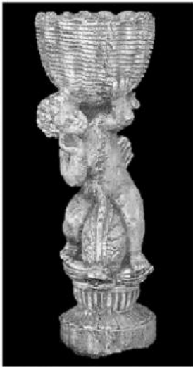
Boy carrying basket