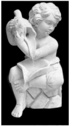
Aquarius Cupe (lrg)