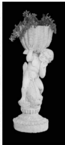
Cupe with basket lrg (R)

1FF043 1420H x 500W Base 540L x 450W 174kg