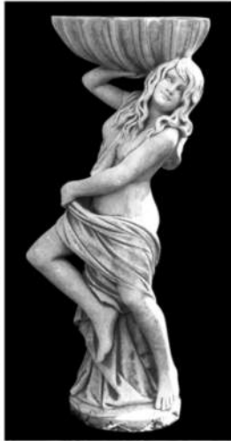
Venere di Phobos