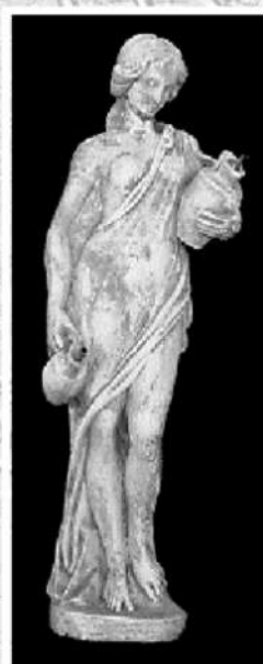
Lady with 2 jars