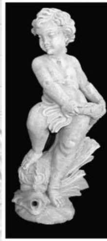
Angelo with fish