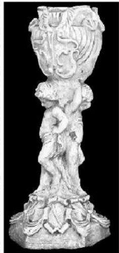
3 Angels with horn of plenty