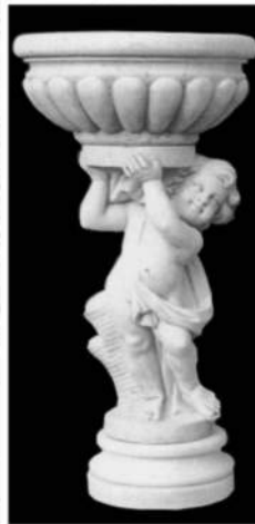
Petri fountain figure 3 piece

1FF035 600H x 230Ø 72kg 1FF035A Petri fountain figure